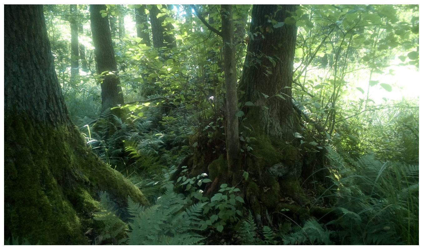
Old-growth alder carr stand.