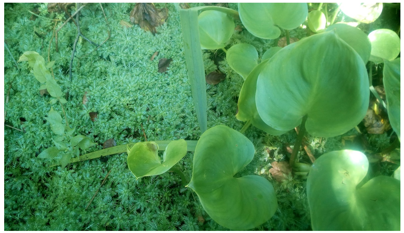
There are Hottonia palustris and Calla palustris.